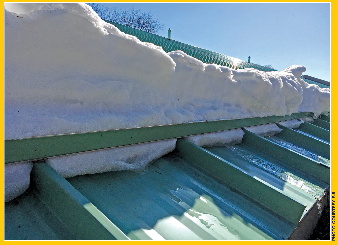
THE ONLY MAGAZINE DEDICATED TO THE EFFECTS OF WEATHER AND CLIMATE ON ROOFING